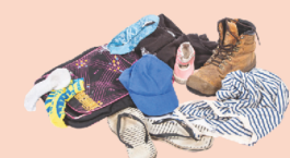
Old Clothes, Shoes & Bedding