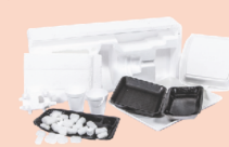
Foam & Polystyrene