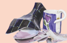
Broken Crockery & Glass