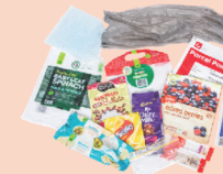
Plastic Bags/Soft Plastics