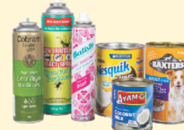
Steel & Empty Aerosol Cans