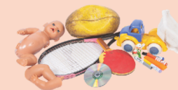
Broken Toys No Batteries