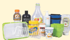
Hard Plastic Containers, Bottles & Garden Pots