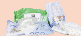
Nappies & Wipes