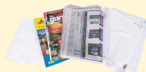
Cardboard, Newspaper & Magazines