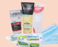
Personal Care Items