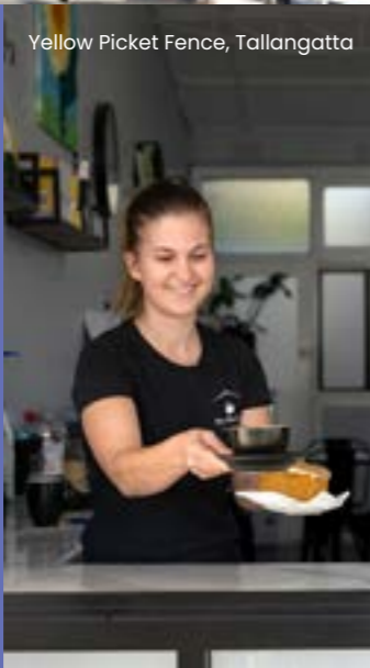
Yellow Picket Fence, Tallangatta

May May 10 Upper Murray Farmers Market Be captivated by the autumnal tones of vibrant yellows, burnished copper, russet reds, and honeyed gold adorning the landscape as the leaves change. This kaleidoscope of colour enhances the scenic drives, walking tracks, nature trails, and lookouts, providing a memorable experience for people of all ages and abilities.