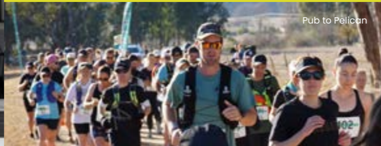
Pub to Pelican

Jul Rug up and discover the magic of July in the Towong Shire, where quintessential Australian snowy mountain views emerge as the fog lifts, revealing scenic landscapes that create magical moments. Travel the Great River Road along the upper Murray River, the Murray Valley Highway, or glimpse Bogong from the Mitta Valley. After a day of exploration, enjoy a hearty meal in one of our many country pubs or hospitality venues, where warmth and comfort await.