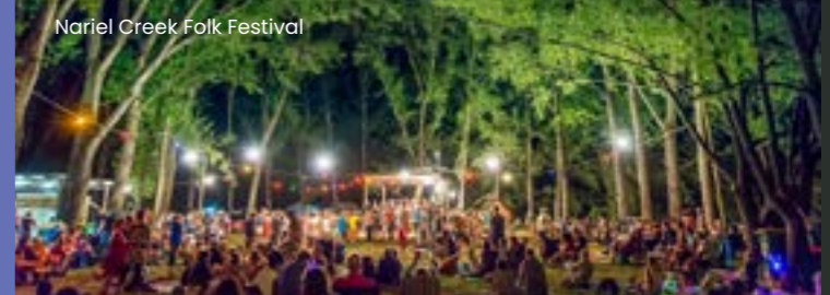
Nariel Creek Folk Festival

Dec Dec 27 - Jan 2 Nariel Creek Folk Festival Warmer weather invites you to explore the Upper Murray, Mitta Valley, and Lake Hume, offering a perfect setting for nature-based activities, scenic beauty, and vibrant events. From local festivals to art installations, there's always something happening, making this region an ideal destination for nature lovers, adventure seekers, and culture enthusiasts alike.