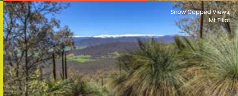
Snow Capped Views, Mt Elliot

Jun Jun 1 Pub to Pelican Marathon, High Country Rail Trail Jun 6-8 Dartmouth Cup Fishing Classic Tucked away in northeast Victoria, the Upper Murray, Mitta Valley, and Lake Hume regions - 'The Undiscovered' - offer pristine waterways, picturesque landscapes, and vibrant communities. Experience four seasons and genuine country hospitality.