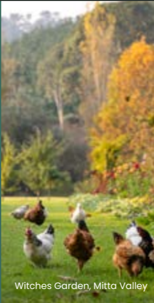
Witches Garden, Mitta Valley

Feb Feb 1-7 Corryong Paragliding Open Feb 8 Butcher's Hook Craft Shop Pop-Up Farm Gate Market, Mitta Mitta Feb 8 Upper Murray Farmers Market Feb 8 Walwa Community Market Feb 9 Sunday Markets @ the Koetong Hotel Feb 16 Lake Hume Cycle Challenge Feb 22 Bullioh Bucks & Does BnS Ball