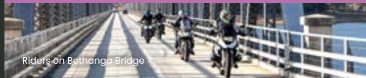
Riders on Bethanga Bridge

Jan Dec 27-Jan 2 Nariel Creek Folk Festival Jan 4 Upper Murray Farmers Market Jan 4-11 Corryong Cup Hang Gliding Competition Jan 11 Butcher's Hook Craft Shop Pop-Up Farm Gate Market, Mitta Mitta Jan 11 Walwa Community Market Jan 12 Sunday Markets @ the Koetong Hotel Jan 25 Butcher's Hook Craft Shop Pop-Up Farm Gate Market, Mitta Mitta Jan 26 Australia Day Celebrations & Breakfast - Bellbridge, Corryong, Eskdale, Tallangatta and Walwa