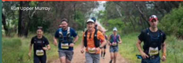
Run Upper Murray

Oct Oct 4 Corryong Show Oct 4 Run Upper Murray, Trail Run Oct 10-12 Tallangatta Valley Stockmans' Ride Oct 12 Tallangatta Tall Trestle Treadle, High Country Rail Trail Oct 18-19 Leigh Martin Marine Mercury Fishing Classic Lake Hume Oct 24-25 Colac Colac Caravan Park Concert Weekend Oct 26 Tallangatta Classics Inc. Show'N'Shine & Swap Meet