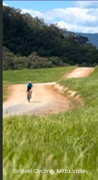
Gravel Cycling, Mitta Valley

Sep Sep 20 Cudgewa Trash 'N' Treasure Trail and Pop-Up Cafe Spring has sprung! There are seasonal markets to look forward to, from October to May. Visit the Peninsula Seasonal Markets, Upper Murray Farmers Markets in Corryong, Butcher's Hook Craft Shop Pop Up Farm Gate Markets in Mitta Mitta, Walwa Community Markets, Khancoban Alpine Inn Markets, and the markets in the beer garden at the Koetong Hotel. Trout fishing season begins in Victoria.