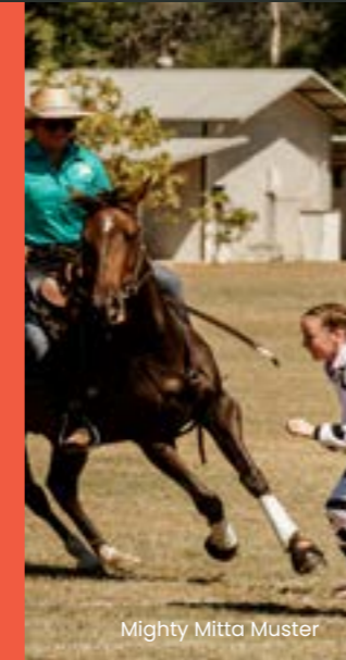
Mighty Mitta Muster

Mar Mar 8 Tallangatta Show Mar 8 Butcher's Hook Craft Shop Pop-Up Farm Gate Market, Mitta Mitta Mar 8 Towong Cup Races Mar 8-9 Mighty Mitta Muster Mar 9 Upper Murray Farmers Market Mar 9 Sunday Markets @ the Koetong Hotel Mar 10-13 Targa Classica 2025, Classic Car Event